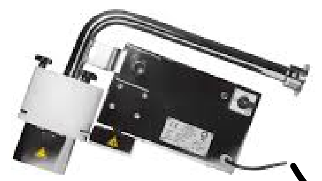
Meat ball maker