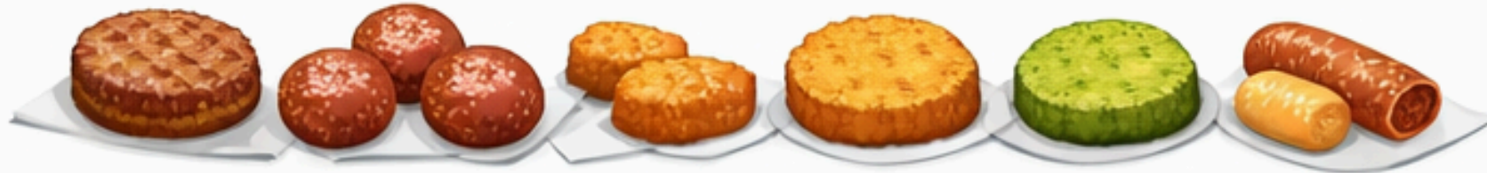
Patties Meatballs Nuggets Fish Cake Oval / Cylinders