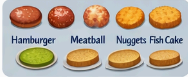
Patty & Meatball Forming